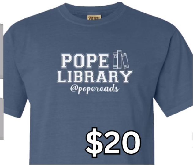
Pope Elementary Panthers Volunteer T-Shirt